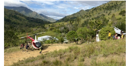
In Papua New Guinea, they brought tribal church leaders of Wantakia to this one in Menya in order to help counsel and train the new church leaders there.