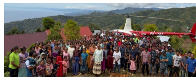
The very first landing in Lauje, Indonesia where there is a church currently doing outreaches in nearby villages but will now be able to use the helicopter!

We are thankful that after all of that we've had some respite as a family (minus Maycie!) before things pick up again here in the next few weeks.