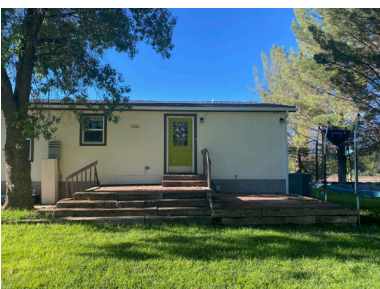
<Before & After>